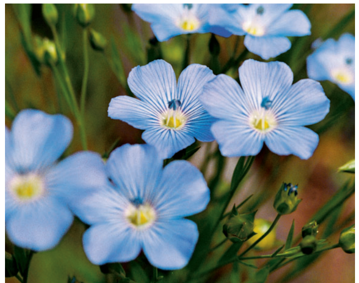
Linseed oil, which is produced from the Flax plant (pictured above), is a key ingredient in Marmoleum.